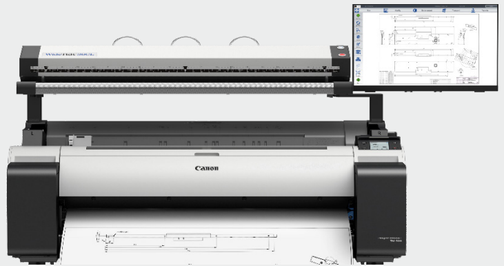
Scanner mounted on Canon printer