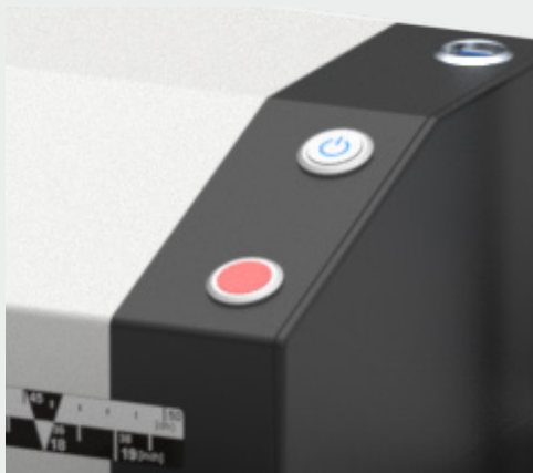
Save scans to the USB-port

The WideTEK36CL-600-MF5 solution is by far the fastest color CIS scanner on the market, running at 10 inches per second at 200 dpi in full color. At the full width of 36" and at 600 dpi resolution, the scanner still runs at 1.7 inches per second. The scanning speeds are tripled in black and white and greyscale modes but can be individually configured if required; for example, to scan fragile, valuable documents.